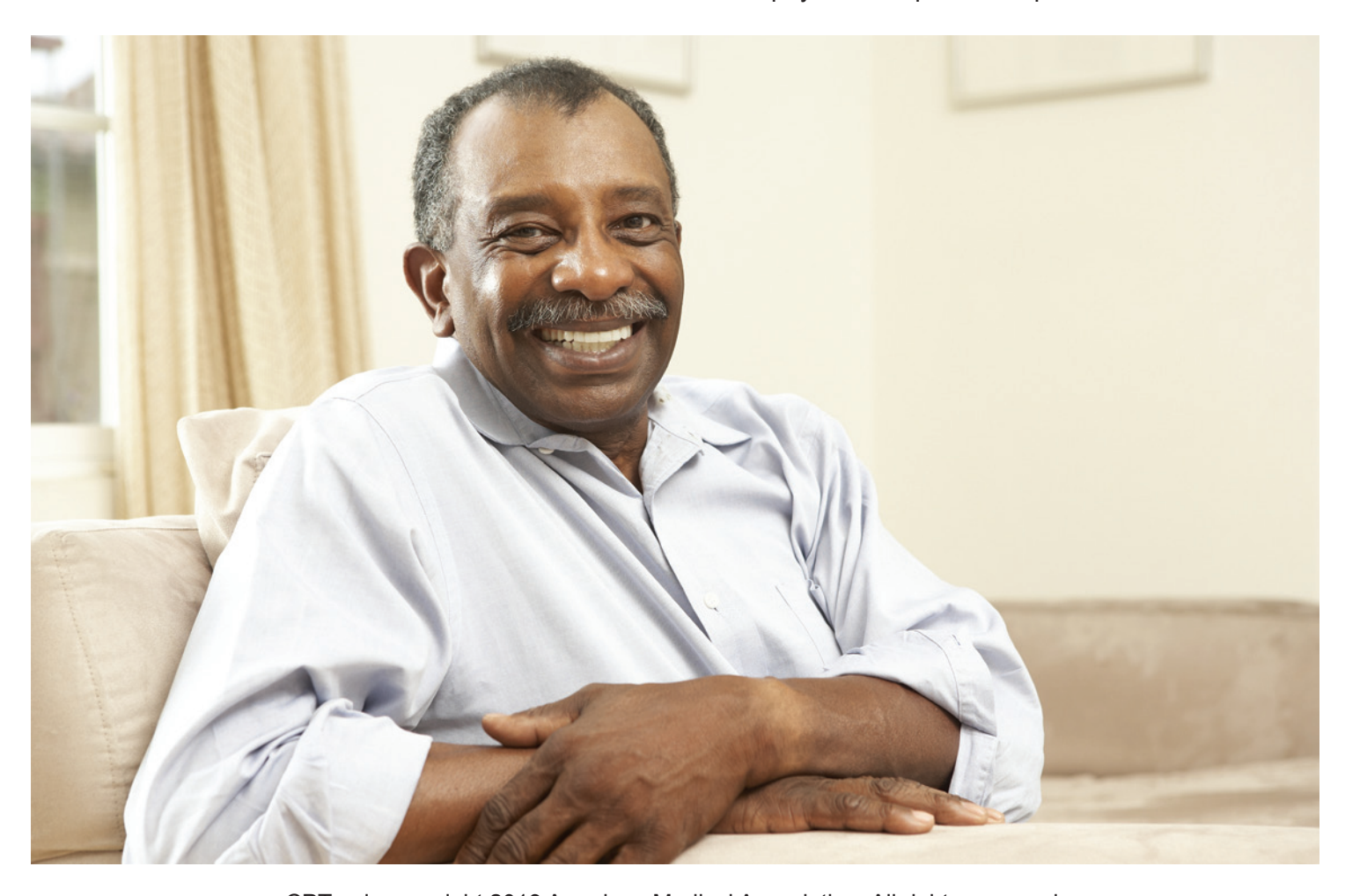
CPT only copyright 2013 American Medical Association. All rights reserved.

Note: When a CMHC serves as an originating site, the originating site facility fee does not count toward the number of services used to determine payment for partial hospitalization services.